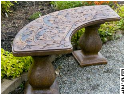
In the hummingbird series; Curved Bench, Birdbath, Pot

In this popular series of garden statuary, talented artist Klaus Kinast has carefully sculpted hummingbird themed 'bas-relief' (low relief) onto the surface of each piece. Hummingbirds are among the smallest of birds, hovering in mid-air seemingly motionless by beating their wings up to 90 times a second. Hummingbirds are the only birds that can fly backwards.