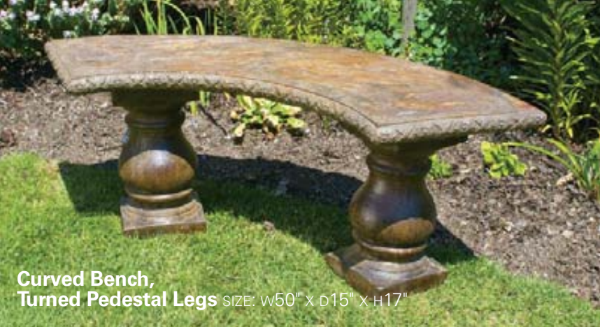
Curved Bench, Turned Pedestal Legs SIZE: W50" X D15" X H17"