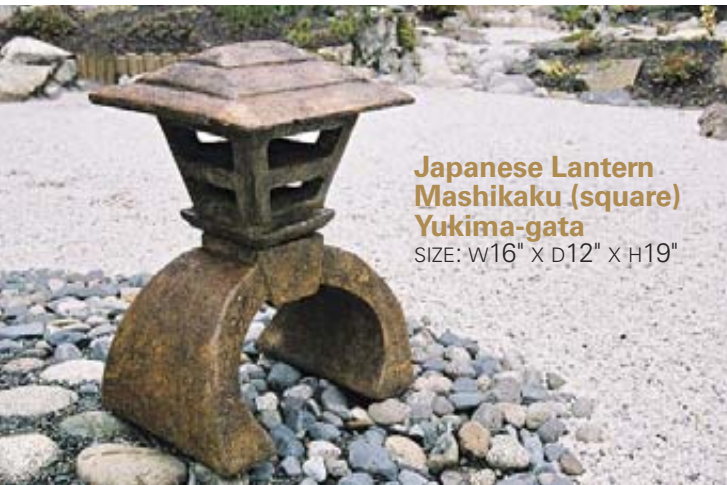
Japanese Lantern Mashikaku (square) Yukima-gata