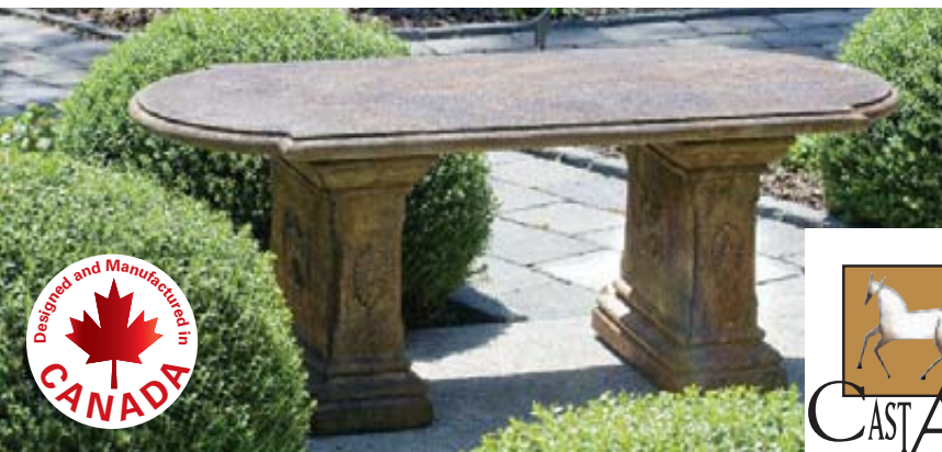
American Colonial Bench - Straight