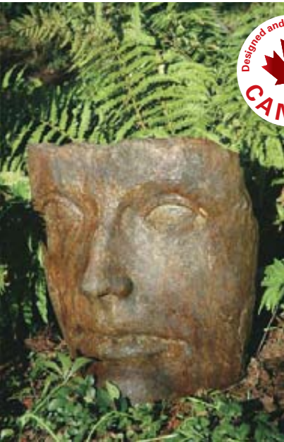
Portrait of Mother Nature