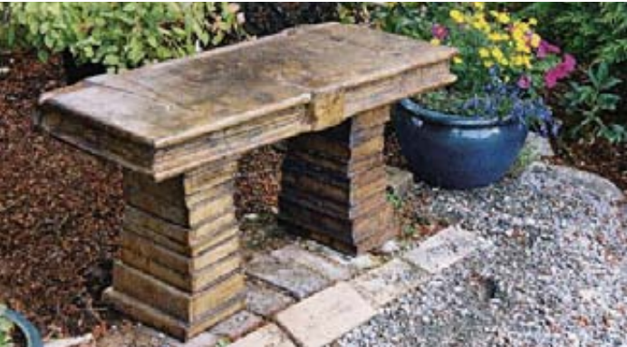
Seat of Wisdom SIZE: W36" X D16" X H18"