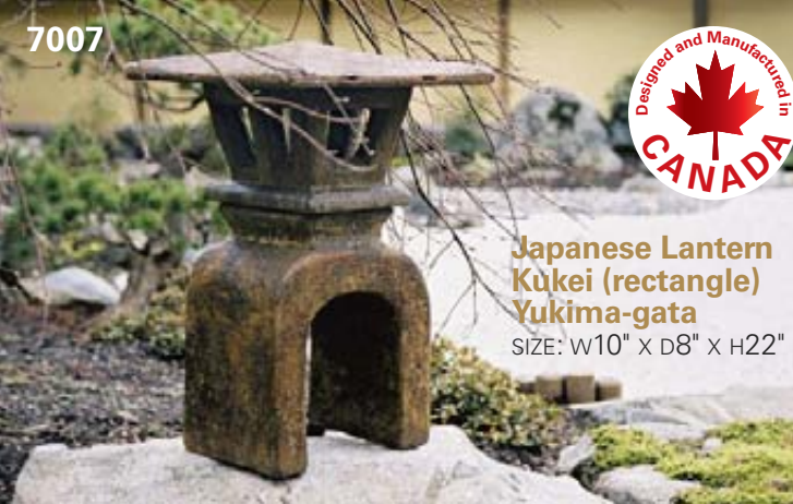
Japanese Lantern Kukei (rectangle) Yukima-gata