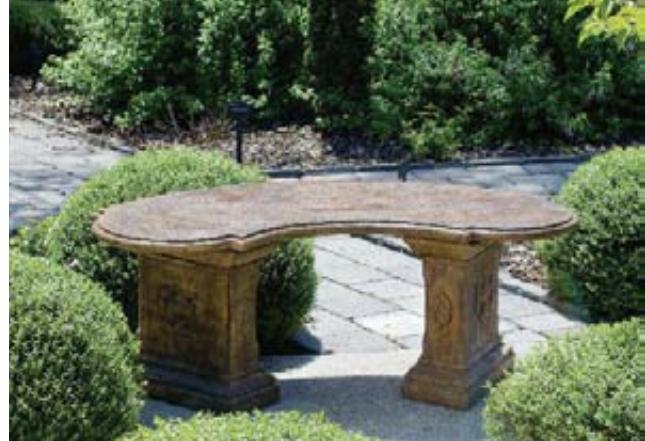
American Colonial Bench - Curved SIZE: W45" X D18" X H18"