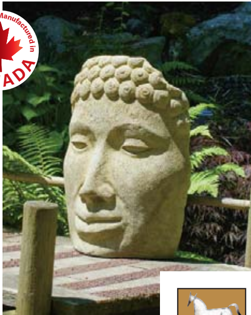
Buddha Face - Large