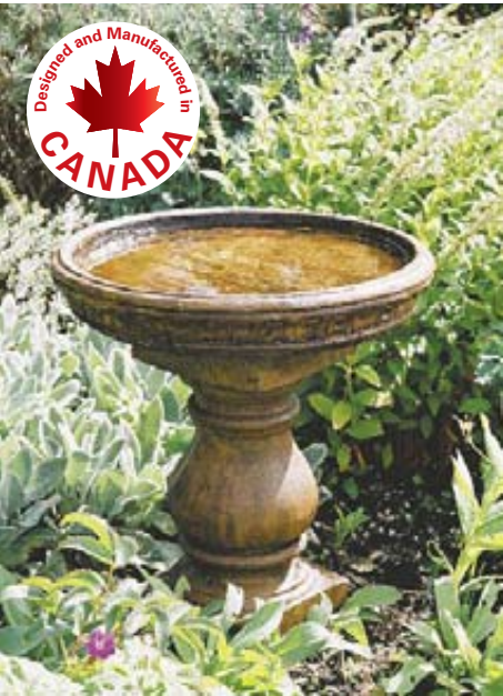
Turned Pedestal Birdbath SIZE: W19" X D19" X H19"