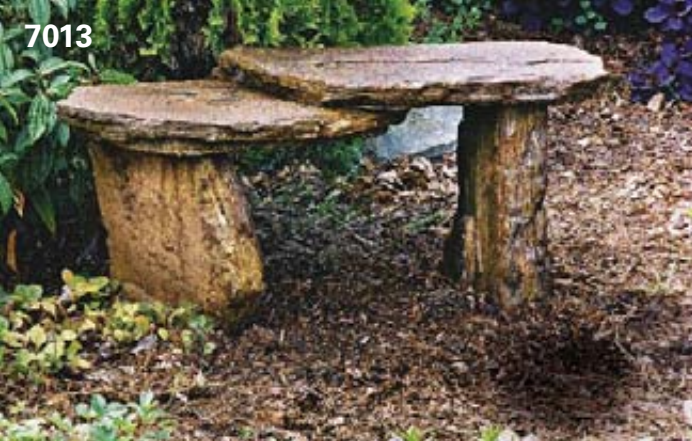
Slate Bench SIZE: W45" X D21" X H20"