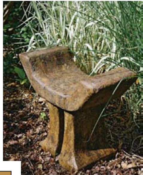
Buddhist Temple Seat